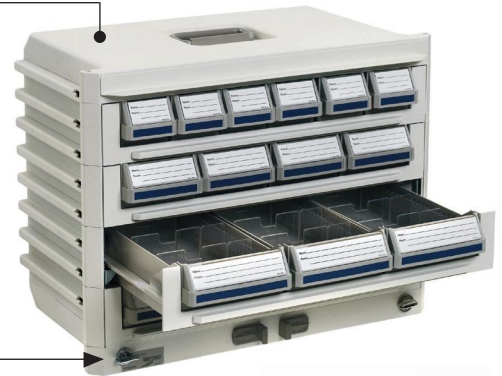
Cassette shown in "Full Level" Mode