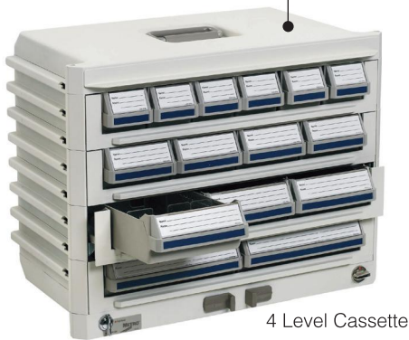
4 Level Cassette