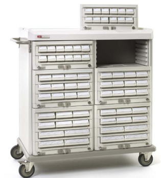
Double-Wide, Double Sided Medication Cassette Transfer Cart Cat. No. SXRD46TRAN (shown with cassettes and bins, sold separately, see above)

*Cassette storage available on both front and back of cart.